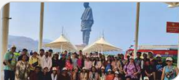
SoU (Feb. 2026)