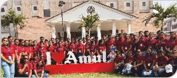
Amul Chocolate Plant (Feb. 2026)

The objective of industrial visit is to provide an insight regarding internal working of companies. Theoretical knowledge is not sufficient for professional career. With an aim to go beyond academics, industrial visits provide students a practical perspective of the work place.