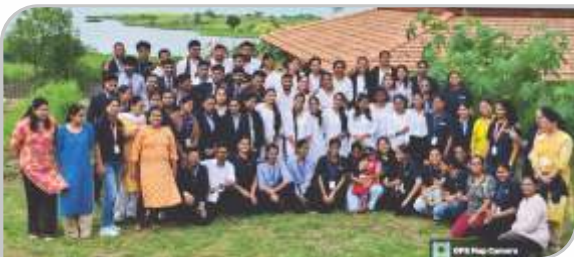
Re-Charkha Visit (2025)