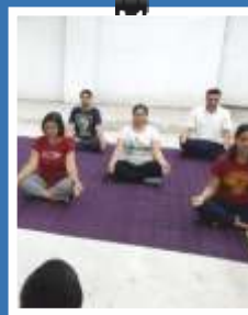
International Yoga day