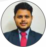
Om Jagtap Wallstreet Equity Analysis