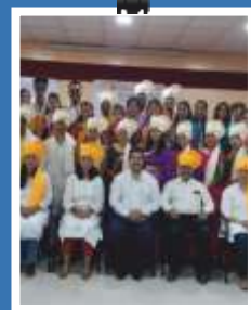
Marathi Rajbhasha Din