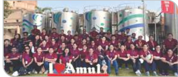
Amul Dairy Plant (Feb. 2026)