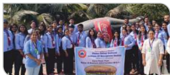
Coca Cola, Hyderabad (2020)