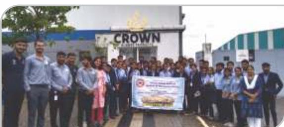
Crown Rubber Products, Pune (2023)