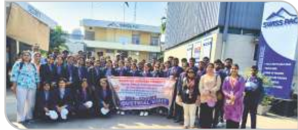
Swiss Pack Plant (Feb. 2026)