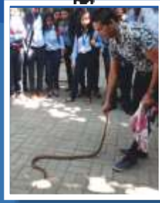
Snake Rescue Training