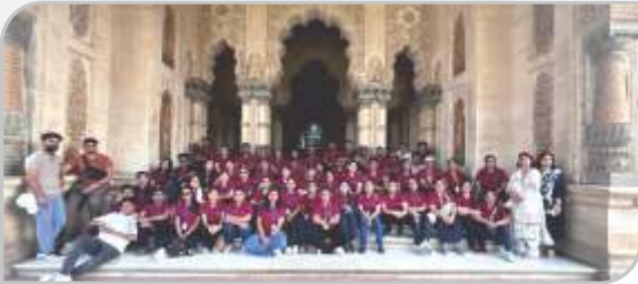
Laxmi Vilas Palace (Feb. 2026)