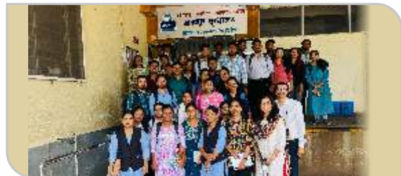
Katraj Dairy, Pune (2024)