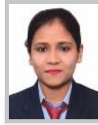
Binita Mal Kan Biosys